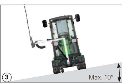
Do not drive on slopes with an incline of more than 10°