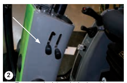
Transport lock in unlocked position