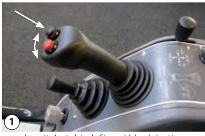
Joystick right - left and black button