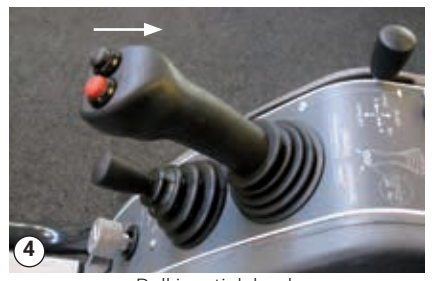
Pull joystick back