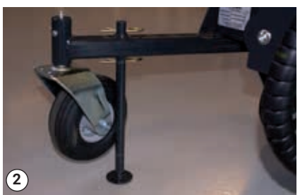
Support strut lowered