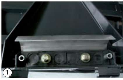
Cleaning the couplings

Blade replacement must only be carried out by an authorised Egholm dealer