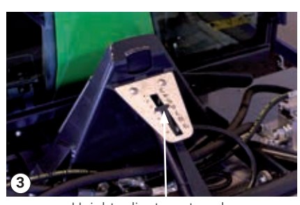
Height adjustment scale