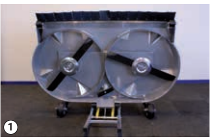
Tip the mower forward.

We recommend that you clean the mower immediately after operation to stop the grass sticking too firmly to the guard and blades.