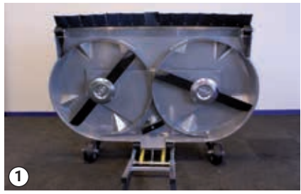
Tip the mower forward

New blades and locking plates can be ordered from an authorised Egholm distributor.