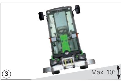
Do not drive on slopes with an incline of more than 10°