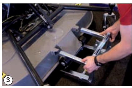
Fit the frame