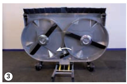
Direction of blade travel