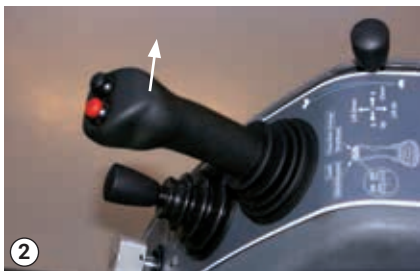
Adjustment handle – Lowering the cutting height